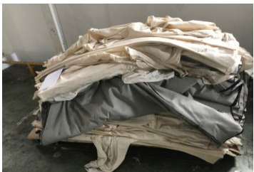
Phase 2 Finishing - Damaged Roof & Wet Grey