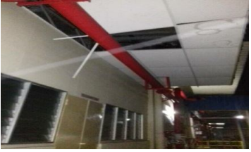
Fire Fighting Equipment Room